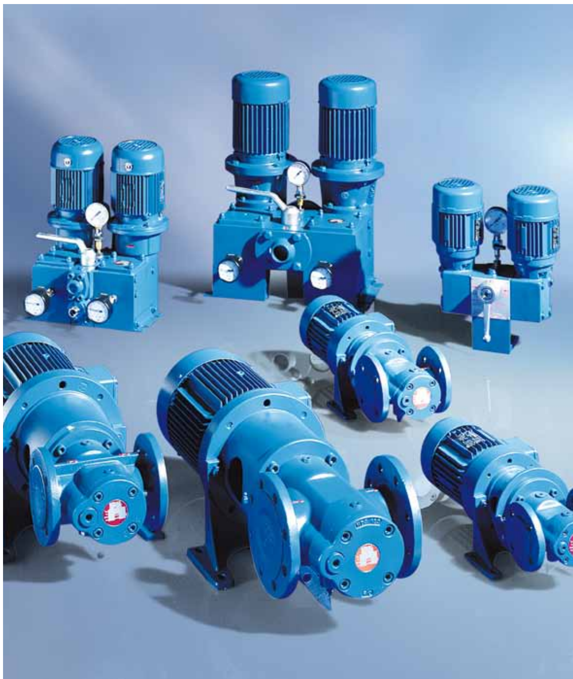
Selection from series K and DL/DS.